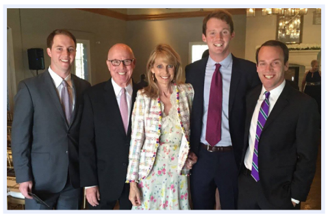
months before he passed away.